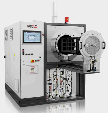
GLO 120/11-1G automatic up to 1100°C with optional hydrogen package and drawer door