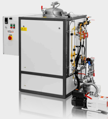
VGLO Top Loader 10/11-1G manual up to 1100°C with optional vacuum pump (750°C max.)