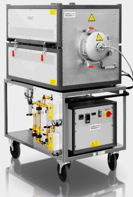
GLO 10/11-1G: Compact hot wall furnace with stainless steel retort and optional inconel retort (vacuum up to 750 °C and under normal pressure up to 1100 °C)