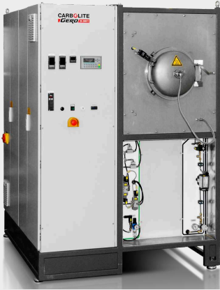
GLO 40/11-1G semi-automatic up to 1100°C