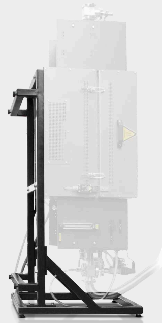
OPTION: VERTICAL STAND